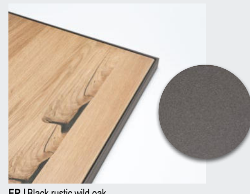
ER | Black rustic wild oak A | anthracite